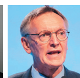
Janez Potočnik Chair FFA2020 and Chairman RISE Foundation