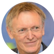
Janez Potočnik Chair FFA2019, Chairman RISE Foundation