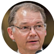
Philippe Lamberts Member of the European Parliament, Co-chair of the Greens/EFA group