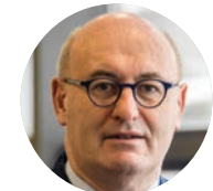
Phil Hogan Commissioner for Agriculture and Rural Development, European Commission