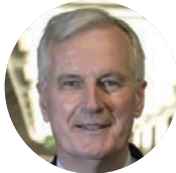
Michel Barnier European Chief Negotiator for the United Kingdom Exiting the European Union