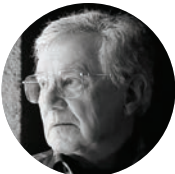
Bernie Krause Soundscape Ecologist