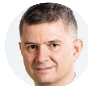
Valeriu Andrei Steriu Member of the Chamber of Deputies, Parliament of Romania