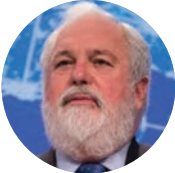
Miguel Arias Cañete Commissioner for Climate Action and Energy, European Commission