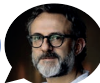
Massimo Bottura Chef Patron of Osteria Francescana & Founder of Food for Soul