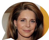
Her Majesty Queen Noor Al Hussein of Jordan International public servant & advocate for cross-cultural understanding & conflict prevention