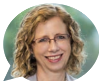
Inger Andersen Director General, International Union for Conservation of Nature (IUCN)