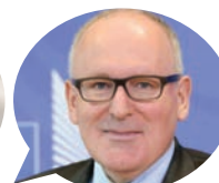
Frans Timmermans First Vice-President of the European Commission, European Commissioner for Better Regulation, Inter-Institutional Relations, Rule of Law & Charter of Fundamental Rights