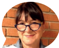
Hilal Elver Special Rapporteur on Right to Food, United Nations