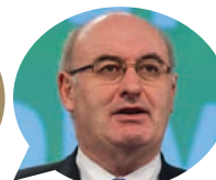
Phil Hogan Commissioner for Agriculture and Rural Development, European Commission