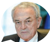
Jean Arthuis Chair of the Committee on Budgets, European Parliament