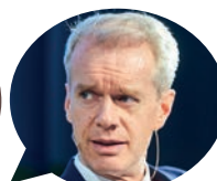
Stephen Sackur Journalist