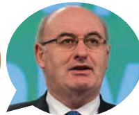
Phil Hogan Commissioner for Agriculture and Rural Development, European Commission