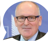
Frans Timmermans First Vice-President of the European Commission, European Commissioner for Better Regulation, Inter-Institutional Relations, Rule of Law & Charter of Fundamental Rights