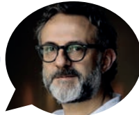
Massimo Bottura Chef Patron of Osteria Francescana & Founder of Food for Soul