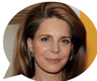
Her Majesty Queen Noor Al Hussein of Jordan International public servant & advocate for cross-cultural understanding & conflict prevention