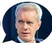
Stephen Sackur Journalist