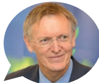
Janez Potočnik Chair FFA2018, Chairman RISE Foundation